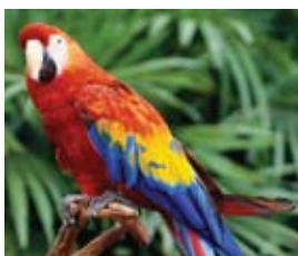
With Photo Enhance