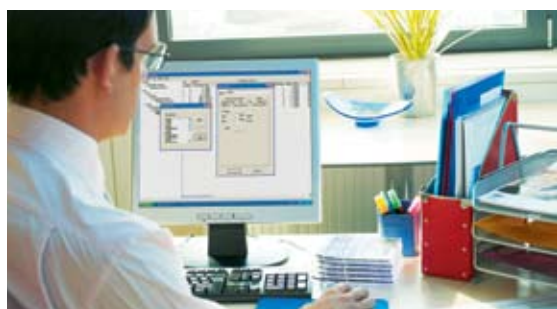
Print Control software allows administrator control and management usage

Ready for the step into colour? Need a truly professional, affordable and versatile printer? Trust OKI Printing Solutions - the business printing specialists with a proven colour heritage.