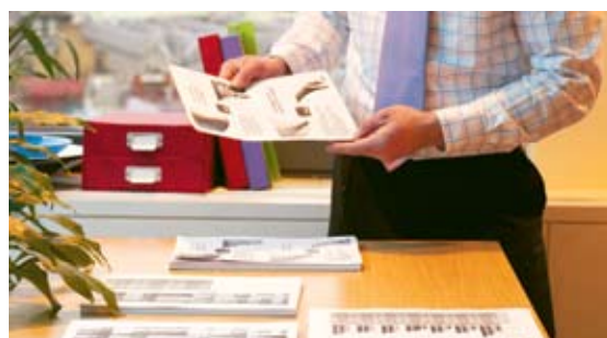
High volume, low cost, mono printing