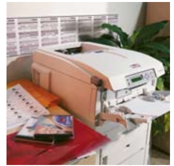
Easy printing of address and CD labels and up to 1.2m banners