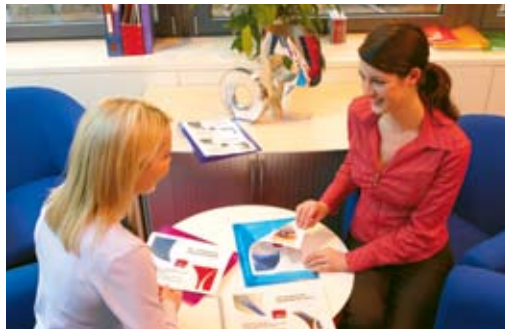
Outstanding quality colour on both sides with automatic duplex