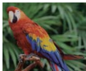
Without Photo Enhance